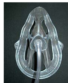
OxyMASK Product # OM-1125-8