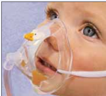
Product # OT-1025-8 Grey Penguin