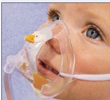
Product # OT-1025-8