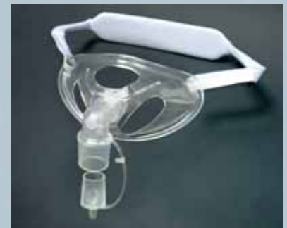
Comfort Strap TCS-1005