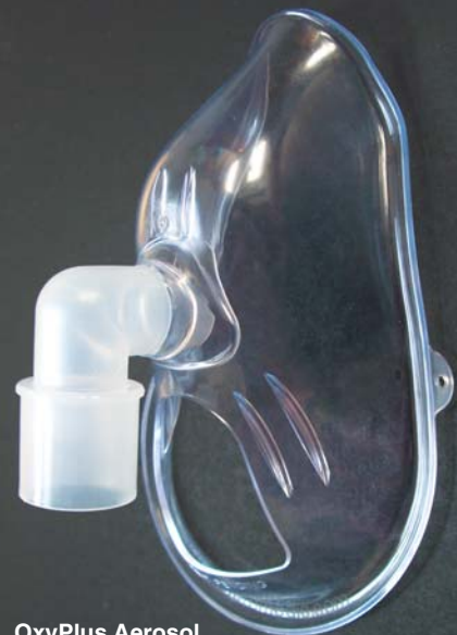
OxyPlus Aerosol OPN-1025 15% larger than OxyMask Aerosol