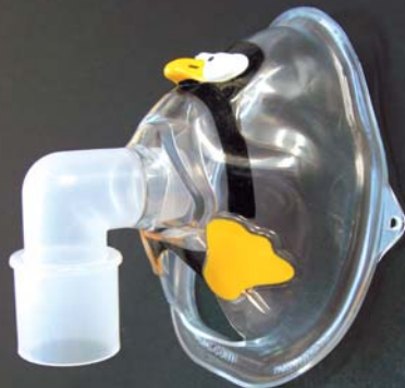
OxyKid Aerosol OKN-1025