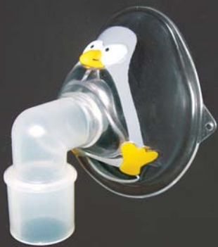
OxyTyke Aerosol OTN-1025